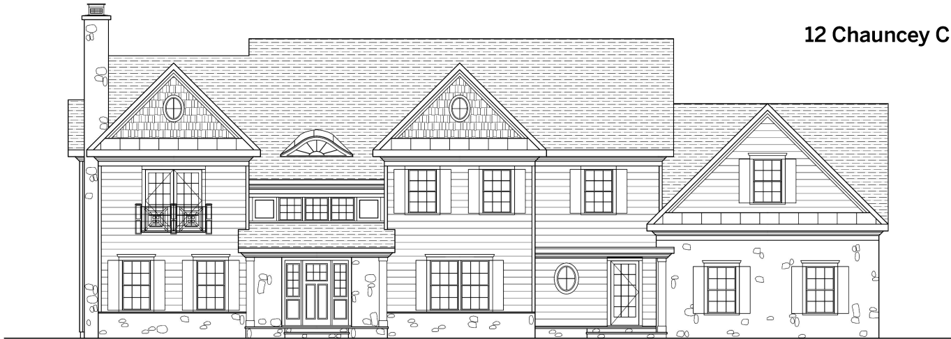
1 PROPOSED FRONT ELEVATION 1/4" = 1'-0"