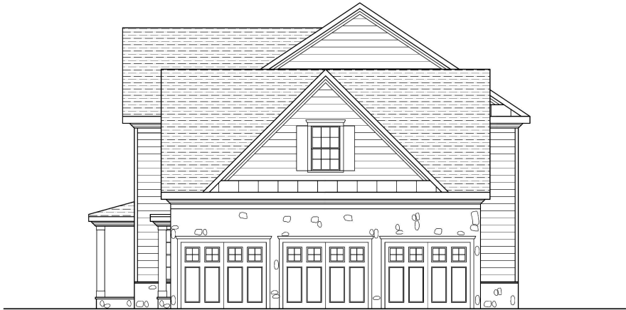
PROPOSED SIDE ELEVATION 1/4" = 1'-0"