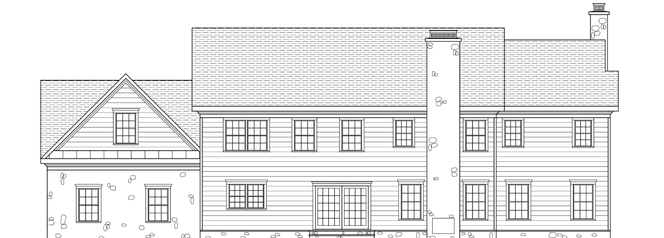
2 PROPOSED REAR ELEVATION 1/4" = 1'-0"