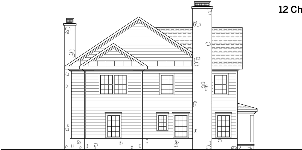
PROPOSED SIDE ELEVATION 1/4" = 1'-0"